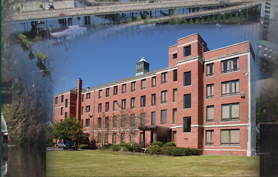
In September 2007, the LSU Interim Hospital opened new psychiatric inpatient units in Uptown New Orleans replacing beds lost when Hurricane Katrina flooded Charity Hospital.