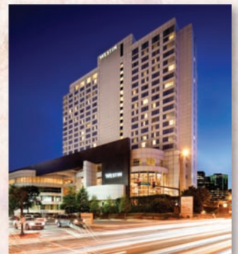
The Westin Buckhead Atlanta

Complete submission instructions available online at www.anpaonline.org/call-for-abstracts Online Meeting Registration Opens December 2016: www.anpaonline.org